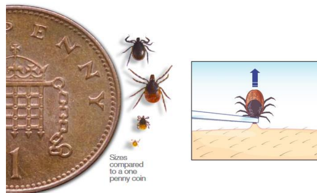
Fig 1 Images of ticks

People bitten by a tick should keep an eye on the bite site for several weeks and if a slowly expanding, reddish, circular rash develops, or if they feel unwell with flu-like symptoms such as fatigue or joint pains, then they should see their GP and mention the tick bite.