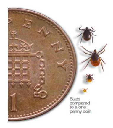
Fig 1 Images of ticks

all skin, or children's or pet's skin after being outdoorsvii. They are often very smallviii but can swell to the size of a small pea during feeding. They like places such as behind knees, ears, armpits, neck and groin. After a while, bacteria may be transferred to the person from the tick, via regurgitation or saliva, so ticks should be removed from people using the correct techniqueix and toolsx (i.e. fine-tipped tweezers or twister tool) as soon as possible. It is generally thought that early tick removal reduces the risk of transmissionxi. Wash the bite with soap and water afterwards and then wipe with antiseptic.