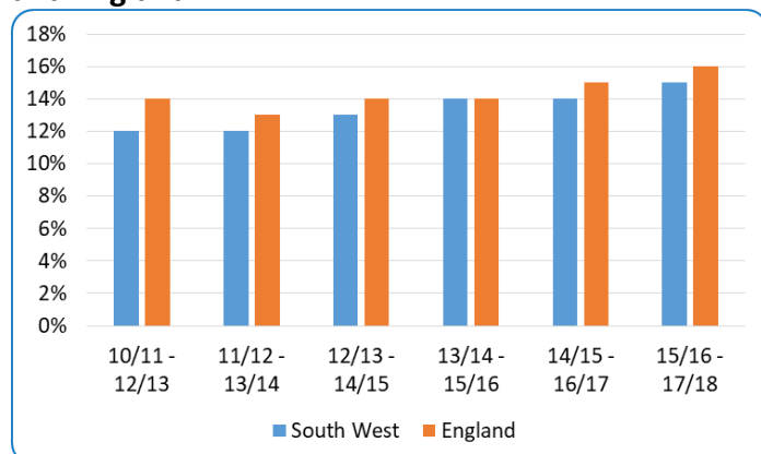
Fig 2: Proportion of pensioners in relative low income households, 3 year average, South West and England